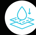
LEAD & CYST FILTER