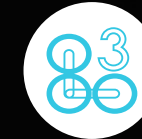
OXYGEN 3 INJECTION