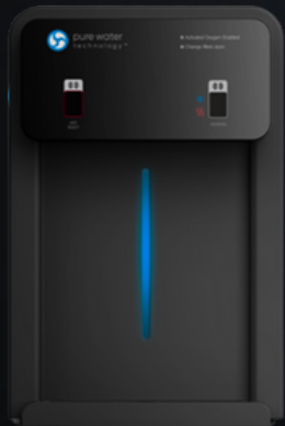
11.7"W x 19.5"D x 17.8"H