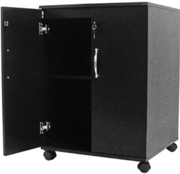
OPTIONAL BASE CABINET

THE CAFFEIN8 S1 SUPPORTS A COOPERATIVE CULTURE IN THE OFFICE, OFFERING HIGH-QUALITY COFFEE, A PREMIUM USER EXPERIENCE, AND A COMPREHENSIVE LIST OF HOT DRINK OFFERINGS.