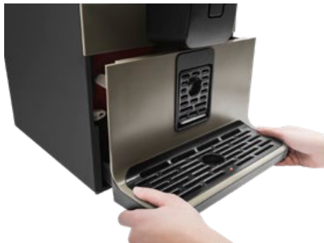
EASY-WASTE REMOVAL TRAY

BEST FOR AREAS WITH LIMITED COUNTERTOP SPACE