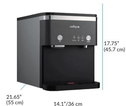
Ontional base available

LED UV to help maintain water reservoir cleanliness.